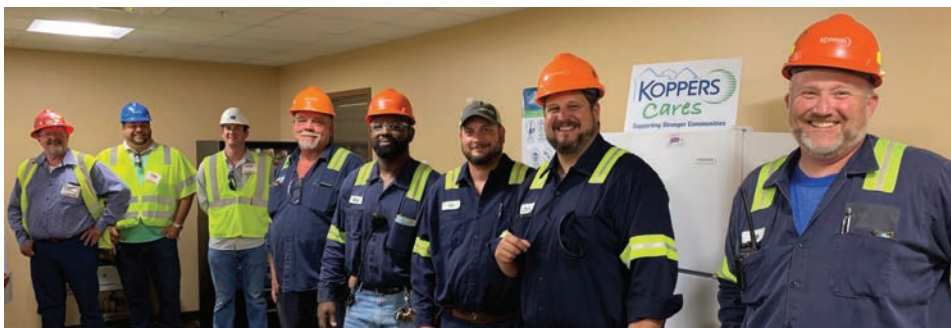
A stop at the Koppers North Little Rock plant rounded out the day's activities. The plant management team poses for a photo after providing a safety briefing.