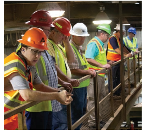
The group pauses on a catwalk to look at the operation from above.