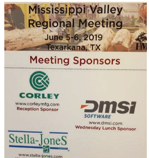
Thanks to the HMA and their sponsors for the invitation and the great food! ➤