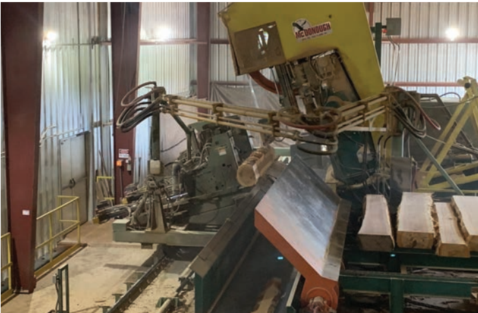
The sawer at Brazeale Lumber is hard at work cutting lumber and ties.