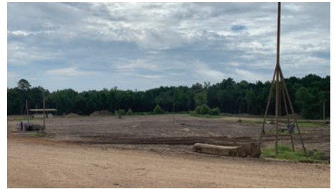
This log yard should be full. The Douthits have enough to run for a while, but the rain has been relentless.