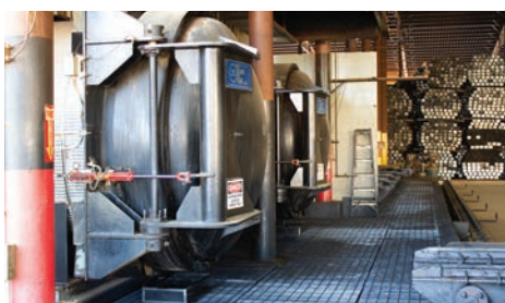
The treating cylinders at the fully automated plant are put to good use to preserve the ties Union Pacific and a few commercial customers require.