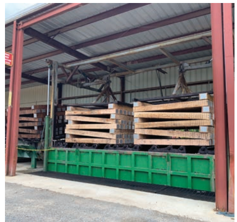
Next stop was the Gross & Janes Camden plant where the borate dip tanks are getting good use.