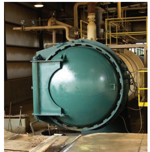
The treating cylinder is put to good use with utility poles inside.