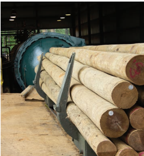
While outside the poles await the next phase of their journey.