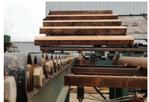
New ties coming off the line ready to ship to waiting plants.