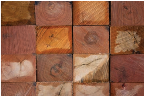
Douthit's ties ready for shipping look like a work of art. And as wet as it has been, they are probably just as valuable to the lucky buyer.