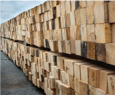
First stop was Ward Timber, the largest hardwood sawmill in the state of Texas, where stacks of ties are ready to go out with the next shipment.