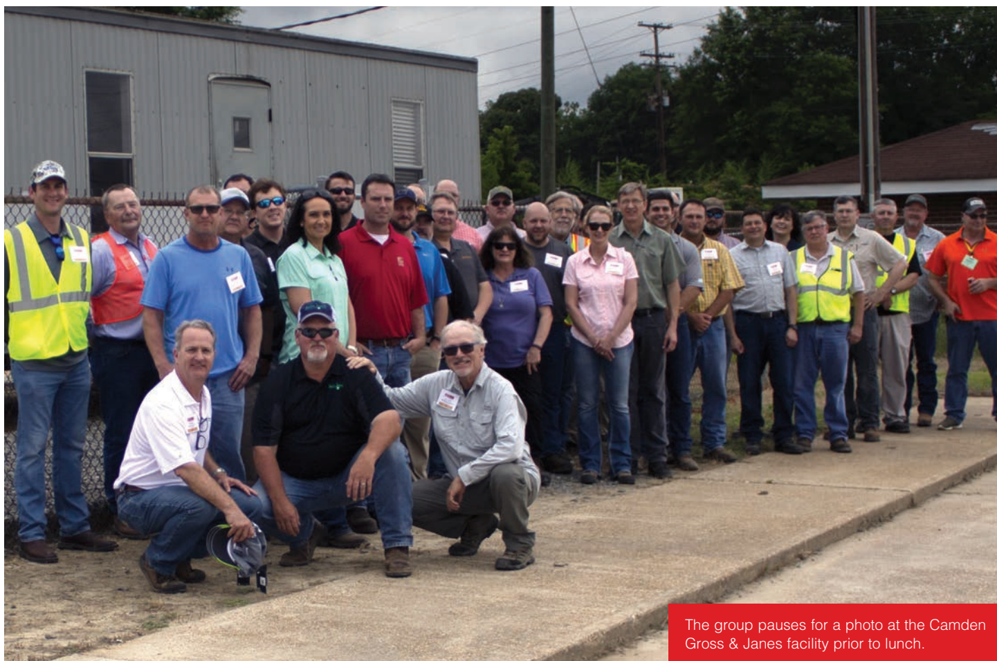
The group pauses for a photo at the Camden Gross & Janes facility prior to lunch.