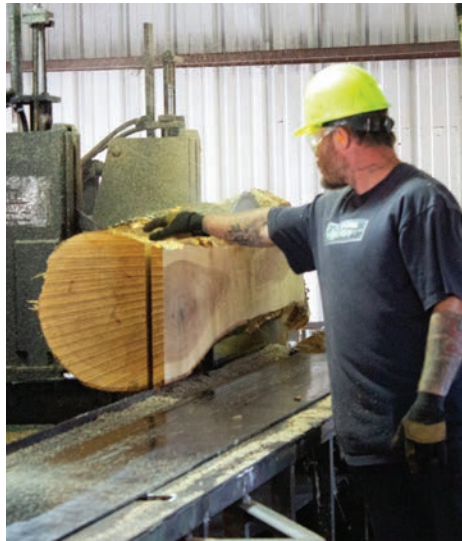
Careful craftsmanship makes a great tie.