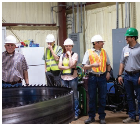
Up close and personal with the sawblade. Wilson Lumber changes the blade daily. Sharpening the blade is an art.