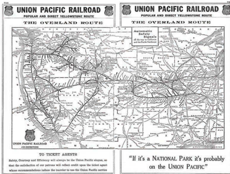
This 1939 map depicts Union Pacific's route to Los Angeles via Las Vegas and its subsidiary The Los Angeles & Salt Lake Railroad.

created on May 15, 1905, when its first land parcels—110 acres—were auctioned off. Three years later, Clark County was established and named in honor of William A. Clark whose vision and commitment to the Salt Lake Route had helped establish Las Vegas.